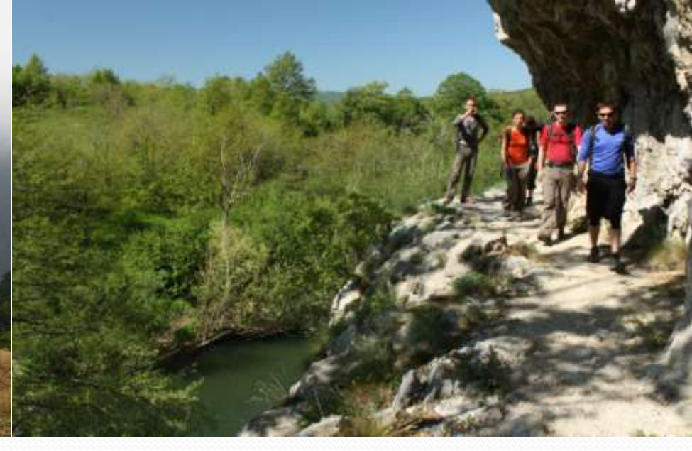
Hiking & Biking