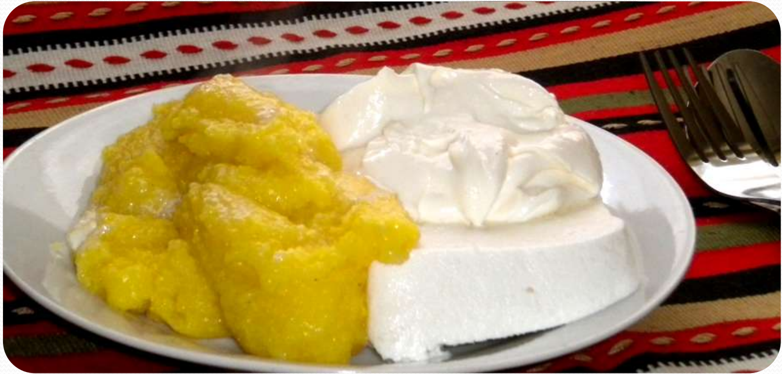
Mamaliga with cream and cheese