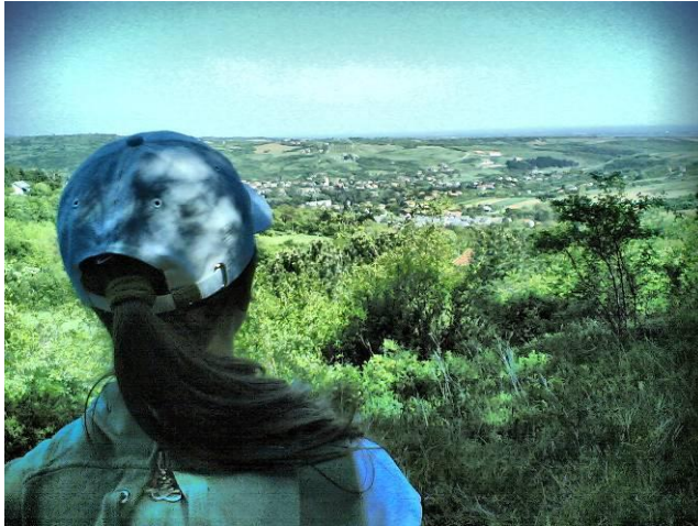
Picture 8 Hiker in Novi Sad, Serbia

distance of 587 km in Serbia. The regions are the following: Zapadana Backa, Juzna Backa, Srem, Beograd, Juzni Banat, Podunavile, Branicevo and Bor.