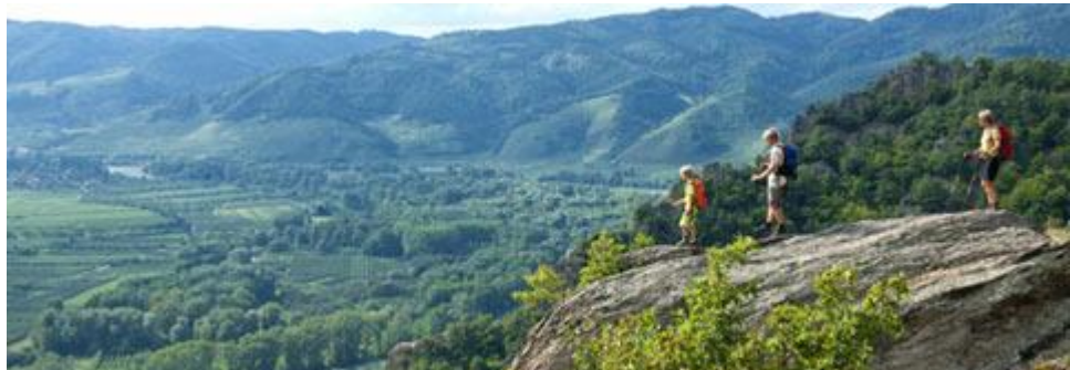
Picture 4 Welterbesteig Wachau

Emmersdorf (Lower Austria) in the north and from Ybbs to Melk in the south.