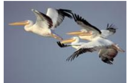
Picture 12 Pelicans in the Ukraine

The Danube gets into the Ukraine near the Lake Cahul, in the Odessa region, and then enters the Danube Delta Reserve before finally leading to the Black Sea. Reni and Izmail are directly located at the Danube. Given the fact that the Romanian-Ukrainian border leads through the Danube Delta Reserve, visiting the Reserve from both sides represents a natural and cultural experience to visitors. Hikers within the Odessa region mainly come from the nearer surroundings and only few from Russia or other countries. Means of transport are almost equally bus, coach and train. Length of stay is approximately 2- 3 days. Nevertheless the questionnaires answered prove that hiking is not a main activity within the area.