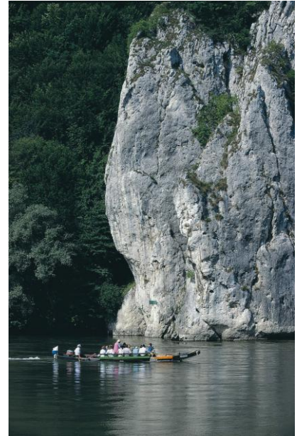
Picture 2 Danube Gorge in Germany

Optimizations of the perfectly continuous hiking area along the Danube in Germany could be standardized way-marking, with standardized resting points, maps and GPS-data, a qualification project and quality label for hosts meeting the requirements of hikers and bookable hiking packages.