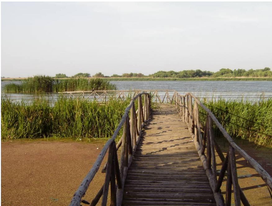
Picture 10 Danube Delta trail

In Romania the Danube passes through 12 counties, namely Caras-Severin, Mehedinti, Dolj, Olt, Teleorman, Galati, Giurgiu, Calarasi, Constanta, Ialomita, Braila and enters the Black Sea in the region of Tulcea. The Danube's macro region is characterised by a huge linguistic, ethnic and religious diversity. In the frame of the transnational project DATOURWAY, committed to the development of tourism along the middle and lower sections of the Danube River, the analysis undertaken for Romania states the fact that the region