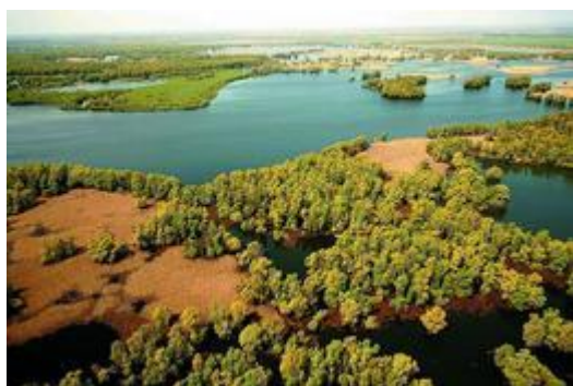
Picture 7 Danube in Croatia

Croatia offers a wide network of hiking trails, mainly in the regions along the Mediterranean Sea, the islands, respectively. Even though hiking is not the main touristic activity in Slavonia, there is potential for cooperation. No information about hikers could be gathered by means of questionnaires.