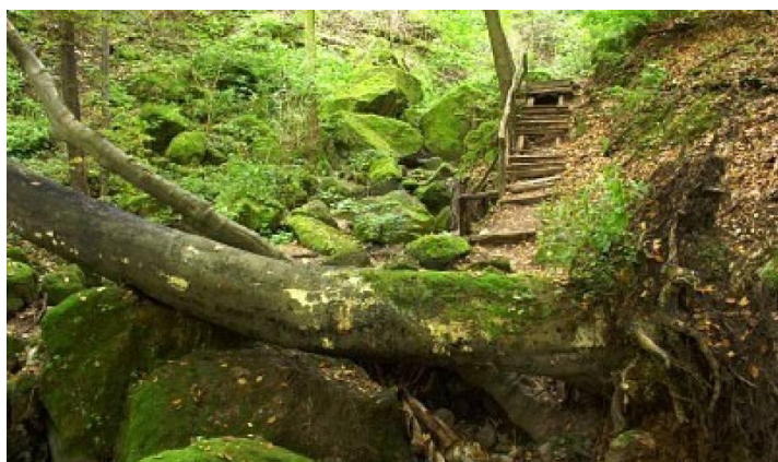
Picture 6 Hiking trail in Hungarian forest

The Hungarian part of the Danube counts up to 417,20 km. The most important Danube cities are Győr, Komarom, Esztergom, Visegrad, Szentendre, Budapest, Dunaujvaros, Kalocsa, Baja, Mohacs.