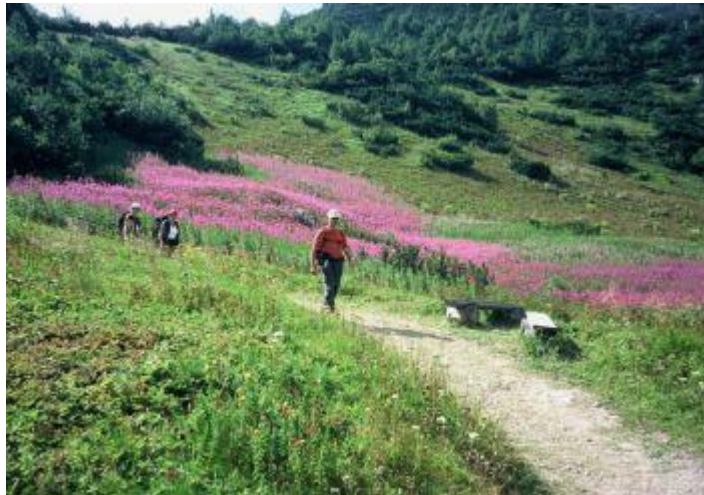
Picture 5 Hiking in Slovakia

Hiking tourism is a very prospective area of the Slovak tourism industry; the total length of marked footpaths is more than 14 000 km. More than 95% of these marked hiking trails are in the hilly part of the country ( http://www.telecom.gov.sk/index/index.php?ids=119830 ). Hiking in