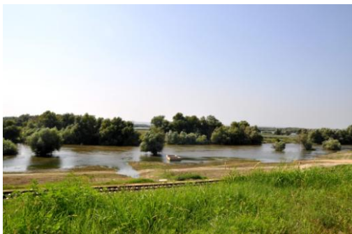
Picture 11 Danube in Moldova

Main incoming destinations are Romania and Turkey, followed by Russia, Ukraine and Italy ( www.tur.md/eng/section/762/ ).