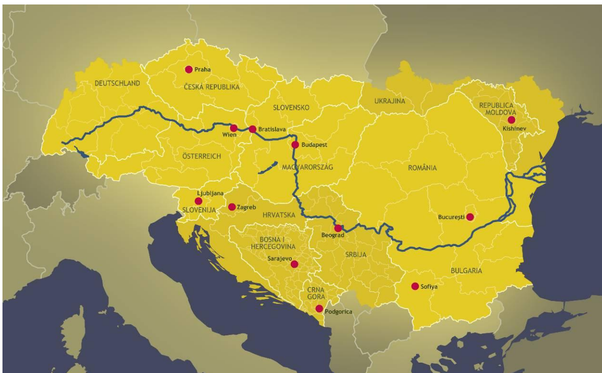
Picture 1 Course of the Danube

The Danube is the second longest river in Europe with an overall length of 2.880 km. This major stream is sourcing in Germany. It passes through Austria, Slovakia, Hungary, Croatia, Serbia, Romania, and Moldova and is ultimately leading through the Danube Delta, Ukraine, into the Black Sea. Hence there are many European countries having the Danube with its economic, natural and touristic potential in common. It links Eastern and Western European countries, culture, people and ideologies on either side of the former iron curtain.