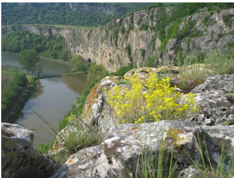
Picture 9 Danube in Russenski Lom, Bulgaria

In Bulgaria the Danube is the border river to Romania and counts up to 471 km. The Danube is the only navigable river in the country ( www.bulgarienweb.de/Geographie.84.0.html )