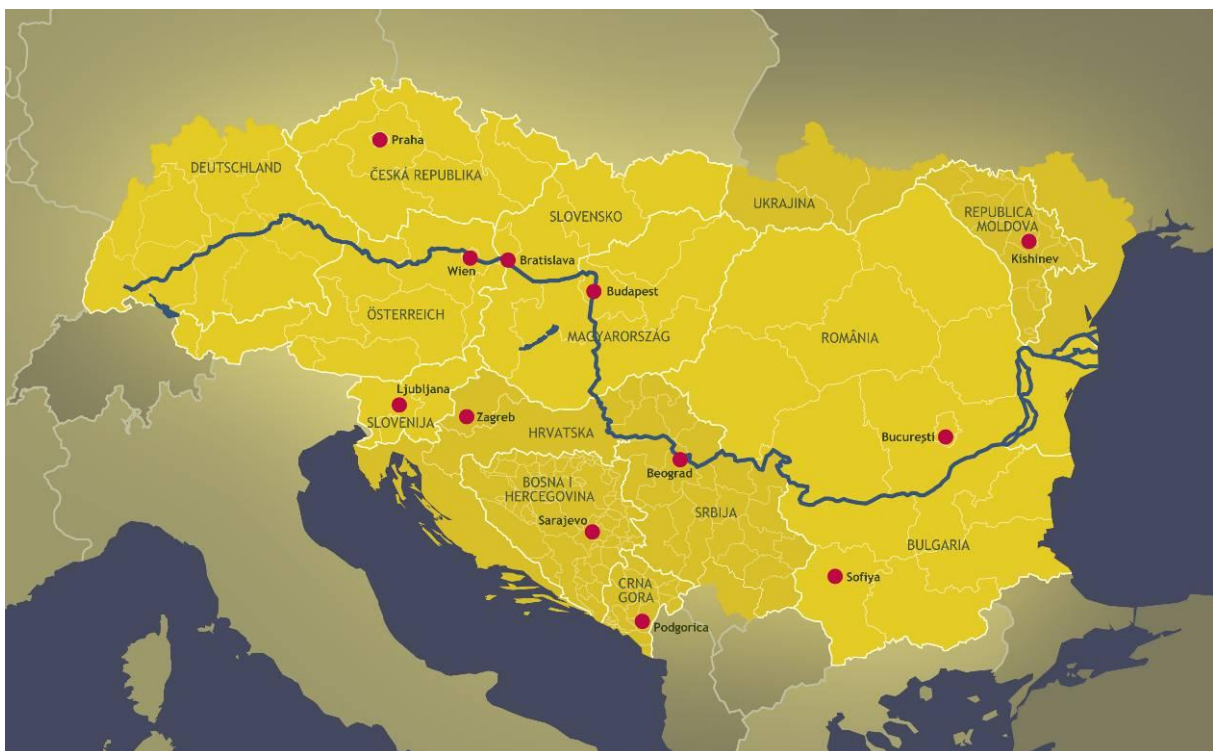
Picture 1 Course of the Danube

The Danube is the second longest river in Europe with an overall length of 2.880 km. This major stream is sourcing in Germany. It passes through Austria, Slovakia, Hungary, Croatia, Serbia, Romania, and Moldova and is ultimately leading through the Danube Delta, Ukraine, into the Black Sea. Hence there are many European countries having the Danube with its economic, natural and touristic potential in common. It links Eastern and Western European countries, culture, people and ideologies on either side of the former iron curtain.