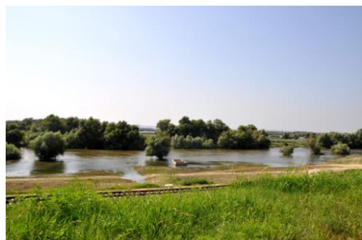
Picture 11 Danube in Moldova

Main incoming destinations are Romania and Turkey, followed by Russia, Ukraine and Italy ( www.tur.md/eng/section/762/ ).