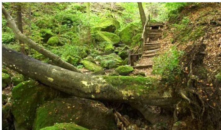
Picture 6 Hiking trail in Hungarian forest

The Hungarian part of the Danube counts up to 417,20 km. The most important Danube cities are Győr, Komarom, Esztergom, Visegrad, Szentendre, Budapest, Dunaujvaros, Kalocsa, Baja, Mohacs.