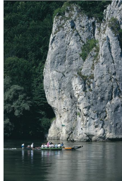
Picture 2 Danube Gorge in Germany

Optimizations of the perfectly continuous hiking area along the Danube in Germany could be standardized way-marking, with standardized resting points, maps and GPS-data, a qualification project and quality label for hosts meeting the requirements of hikers and bookable hiking packages.