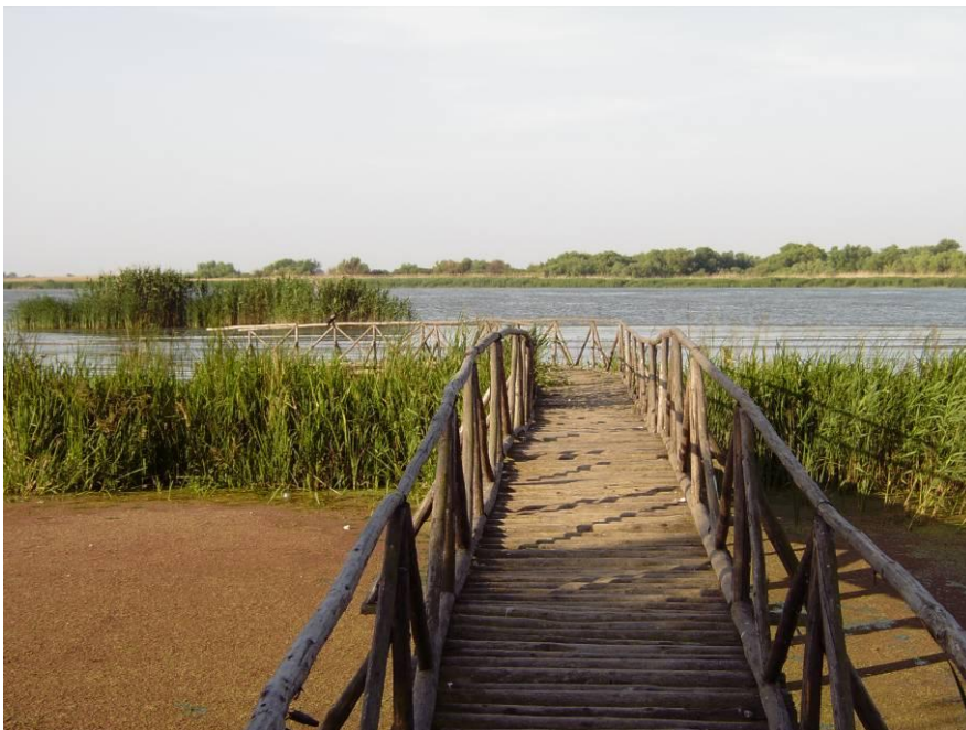
Picture 10 Danube Delta trail

In Romania the Danube passes through 12 counties, namely Caras-Severin, Mehedinti, Dolj, Olt, Teleorman, Galati, Giurgiu, Calarasi, Constanta, Ialomita, Braila and enters the Black Sea in the region of Tulcea. The Danube's macro region is characterised by a huge linguistic, ethnic and religious diversity. In the frame of the transnational project DATOURWAY, committed to the development of tourism along the middle and lower sections of the Danube River, the analysis undertaken for Romania states the fact that the region