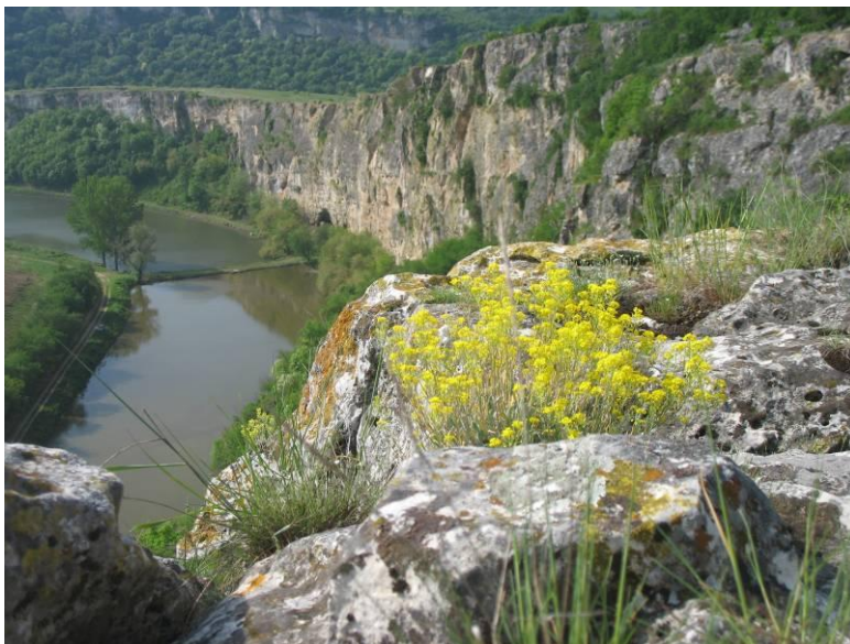
Picture 9 Danube in Russenski Lom, Bulgaria

In Bulgaria the Danube is the border river to Romania and counts up to 471 km. The Danube is the only navigable river in the country ( www.bulgarienweb.de/Geographie.84.0.html )