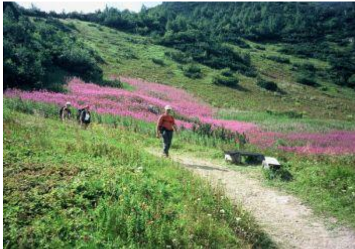
Picture 5 Hiking in Slovakia

Hiking tourism is a very prospective area of the Slovak tourism industry; the total length of marked footpaths is more than 14 000 km. More than 95% of these marked hiking trails are in the hilly part of the country ( http://www.telecom.gov.sk/index/index.php?ids=119830 ). Hiking in